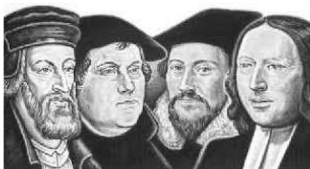
(John Wesley among the Reformers)

Synchronous Class Session Nov. 5-6, 2021, on ZOOM.