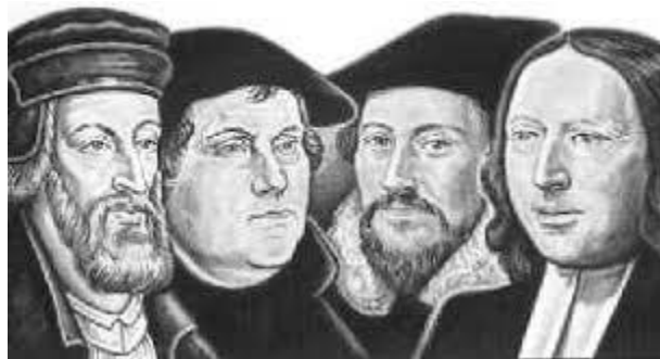
(John Wesley among the Reformers)

Synchronous Class Session Nov. 4 TH (1:00-3:00) on ZOOM.